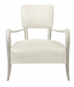
Organic lines and a textural leather seat make for a playful reading perch. Elka Chair , $1,715; bernhardt.com